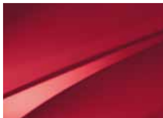
Deep Red (pearlescent)