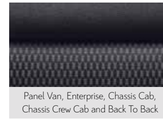
Panel Van, Enterprise, Chassis Cab, Chassis Crew Cab and Back To Back