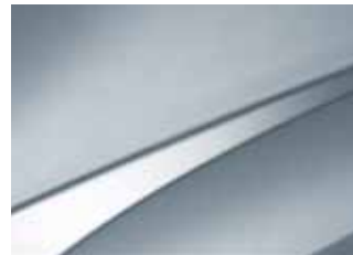
Lake Blue (metallic)