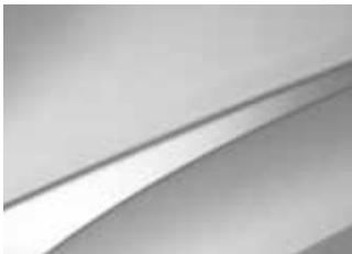
Arctic Steel (metallic)