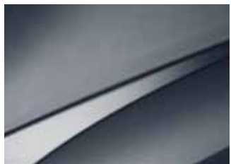
Iron Grey (pearlescent)