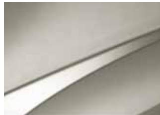
Golden White (metallic)