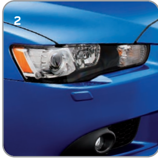
LIGHTNING BLUE (P)