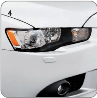
FROST WHITE (S)