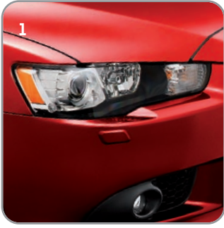
ORIENT RED (M)