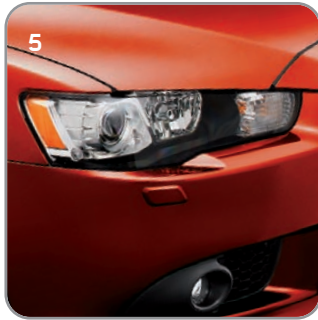
SANTORINO ORANGE (P)