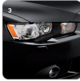
AMETHYST BLACK (P)