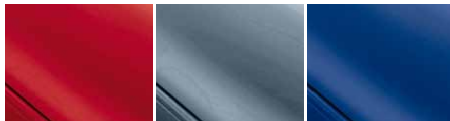
NNJ Ruby Red (MI)